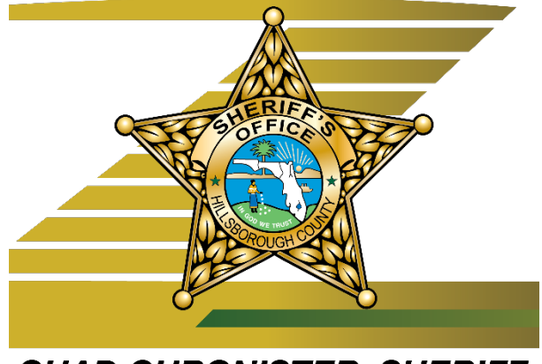
CHAD CHRONISTER, SHERIFF