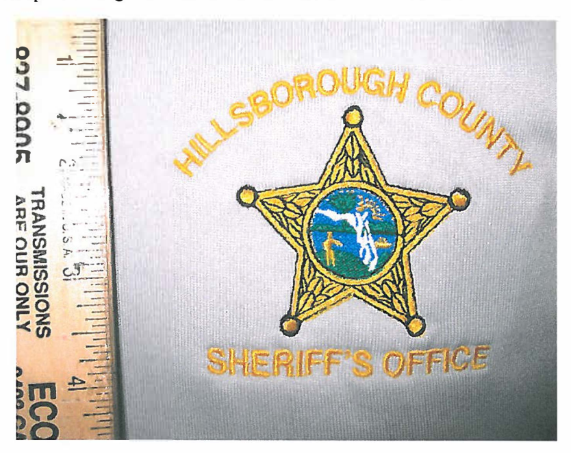
Courthouse CSO Circle Logo, Left Chest

Required in "gold" and "silver" to denote rank of wearer