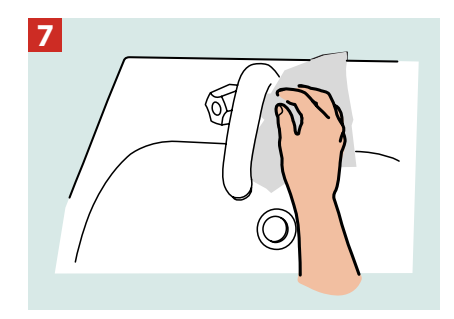
Use towel to turn off faucet and throw it away.