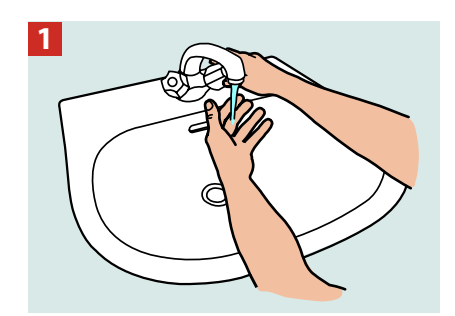
Wet hands with water.

Wash hands with soap and water for 20-30 seconds. If hands are dirty, wash hands with soap and water, not with hand sanitizers, for 40-60 seconds. Use hand sanitizer or chlorinated water, if soap and water are not available.