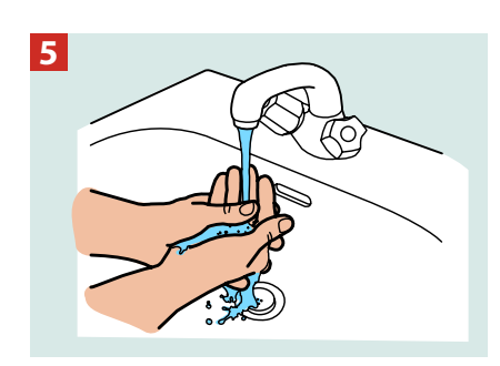
Rinse hands with water.