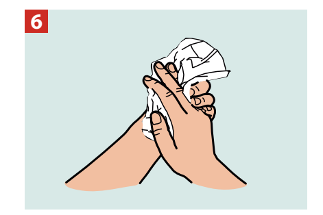
Dry hands completely using a single use towel.